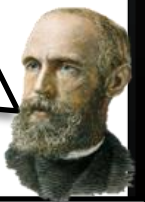
G. STANLEY HALL