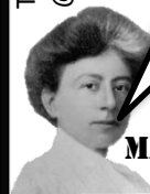
MARGARET FLOY WASHBURN