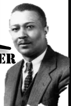
FRANCIS CECIL SUMNER