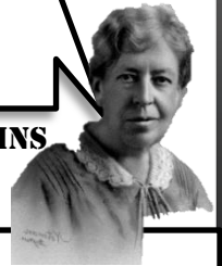
MARY WHITON CALKINS