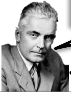
JOHN B. WATSON